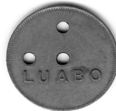
Figure 8: Reverse of Fig. 7.

This was a British-financed company that was established in 1920 to consolidate several sugar estates in Mozambique. The company was nationalized in 1977/8 and its facilities suffered severe damage in the civil war of the 1980s. "Pagamento Homem Prazos" indicates that the tokens were for payment to workers on prazos. Under the Portuguese, the original grants for prazos in Mozambique included almost feudal powers.