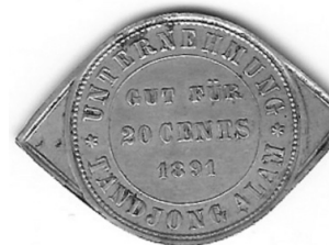
Figure 5: Netherlands East Indies (Indonesia), Unternehmung Tandjong Alam/ Gut für 20 Cents/1891, cupro-nickel (?), 40 x 28 mm. Reverse is blank.

The token is said to have represented 4 ½ pence. Few tokens from foreign investors were pictorial. Most carry only indication of issuer, denomination, and perhaps use; some are crudely made locally. The particularly attractive tokens of some British agency houses in Ceylon were struck in London.