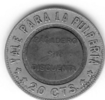
Figure 2: Reverse of Fig. 1. Vale Para la Pulperia/ 20 cts. Pagadero Sin Discuenta.

Dupont is, of course, a U.S.-based multinational. It operated a nitrate mine, Delaware, in Taltal, Antofagasta, with nitrates going directly to its U.S. explosives works. It ran the mine at least from 1918; the mine may have previously been German. By 1927, the development of synthetic ammonia was leading Dupont to cut back on nitrate mining.