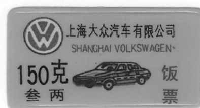
Figure 9: China, Shanghai Volkswagen, plastic, 30 x 55 mm. Reverse is blank.

Luabo is a place name, indicating the location of the plantation. The three holes specify the denomination for illiterate workers.