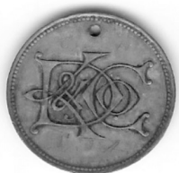
Figure 3: Ceylon (Sri Lanka), KDC monogram of Keir, Dundas & Co., copper, 26 mm.

The inscription states that the token is valid in the company store and is to be honored without discount.