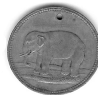
Figure 4: Reverse of Fig. 3.

with D and/or S for the new enterprise. In an 1873 reorganization some or all of its assets were acquired by Duncan, Anderson & Co. Plant disease soon led to Ceylon's shift from coffee to tea exports.