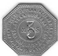
Figure 6: Guatemala, Compañia Hamburguesa de Plantaciones en Guatemala/Osuna Rochela/San Andres Osuna, denominated in Mais [corn], but counterstamped with a "3," brass, 27 mm. Reverse is identical.

The coffee plantations were acquired by German interests in the 1890s. The parent company was listed in a trade directory in 1897 and on the Hamburg stock exchange in 1905. Along with other German properties, its plantations were seized in 1919, at the end of WWI.