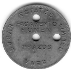
Figure 7: Mozambique, Sena Sugar Estates Limited/ Pagamento Homem Prazos, copper or brass, 33 mm.

The coffee plantations were acquired by German interests in the 1890s. The parent company was listed in a trade directory in 1897 and on the Hamburg stock exchange in 1905. Along with other German properties, its plantations were seized in 1919, at the end of WWI.