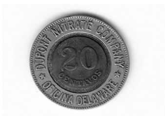
Figure 1: Chile, Dupont Nitrate Company, Oficina Delaware, 20 centavos, nitrate mine, bi-metallic, 28mm.

Dupont is, of course, a U.S.-based multinational. It operated a nitrate mine, Delaware, in Taltal, Antofagasta, with nitrates going directly to its U.S. explosives works. It ran the mine at least from 1918; the mine may have previously been German. By 1927, the development of synthetic ammonia was leading Dupont to cut back on nitrate mining.